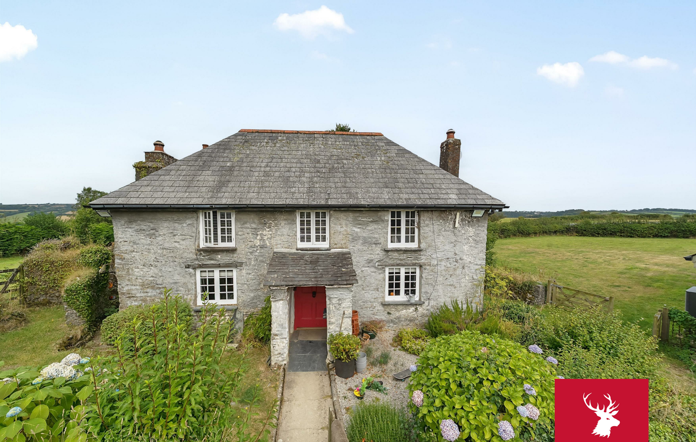
North Muchlarnick Old Farmhouse